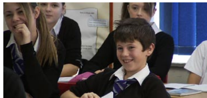
our first online training module

The short modules are designed for use as departmental training materials and are based on material from the DVD-Rom Making Languages Count: inspiring success and raising take-up in MFL through the CILT Cymru Compact scheme , which was sent free to all maintained secondary schools in Wales in September 2008.