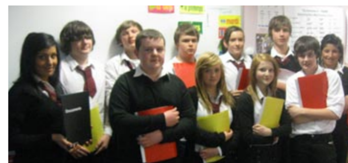
The year 9 students at Hawthorn High School show off their NVQ portfolios