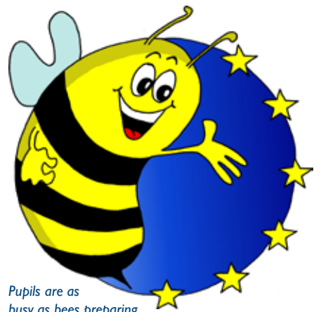
Pupils are as busy as bees preparing for the National Final

The National Spelling Bee is due to take place in Cardiff in July. Year 7 pupils from around the country will come together to compete for the titles of National Spelling Bee Champion in French, Spanish, German and Welsh 2nd Language. Look out for our feature in the next newsletter which will give details of our 2011 Champions.