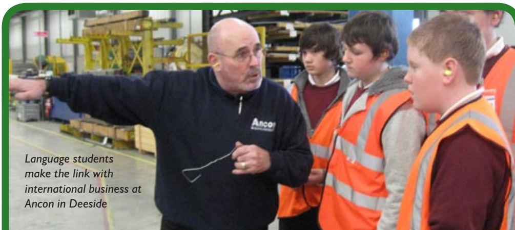
Language students make the link with international business at Ancon in Deeside

Pullout - Routes into Languages Cymru Newsletter