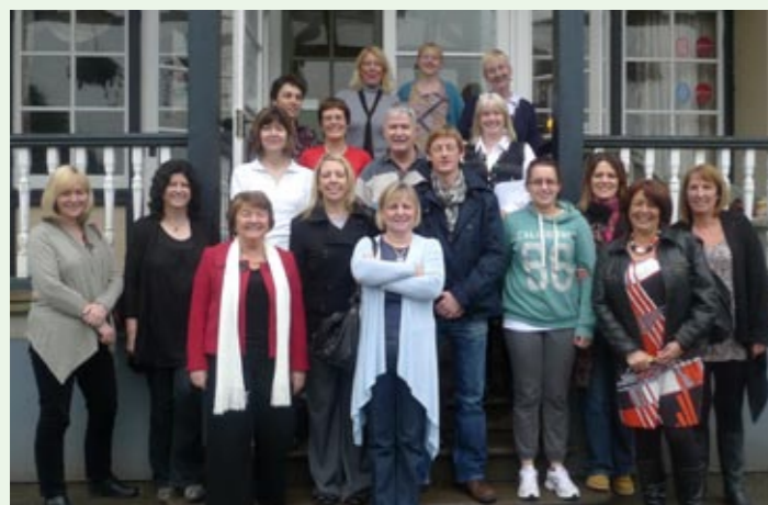
2 Week Primary Teachers' Project 2011