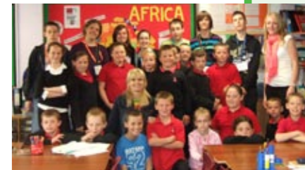
"Dober dan" from Tan y Marian

Ysgol Tan-y-Marian in North Wales recently received a visit from pupils from Slovenia. In partnership with Ysgol Bryn Elian, who is involved in a Comenius Project with the OSNOVNA ŠOLA FRANA