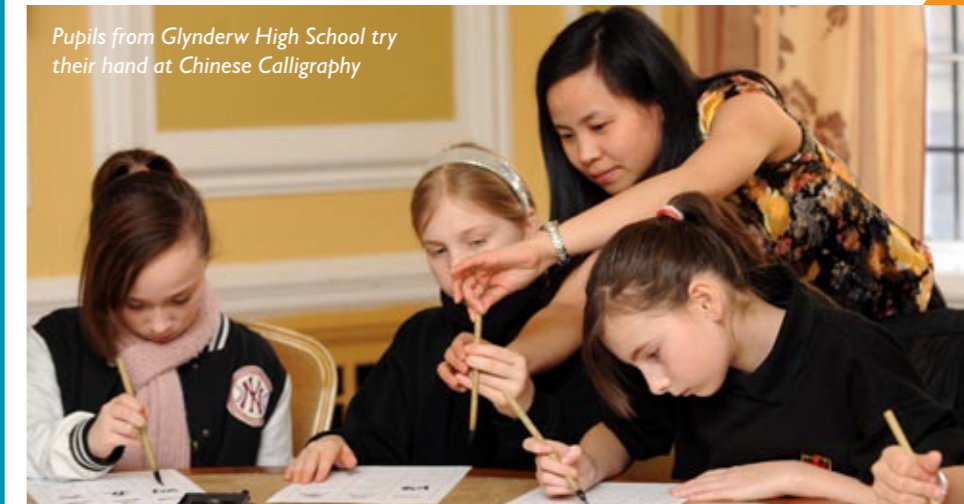
Pupils from Glynderw High School try their hand at Chinese Calligraphy

700 pupils from around the country learn about Wales's European and global links.