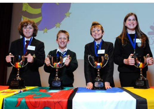
Routes Cymru Spelling Bee Champions 2011