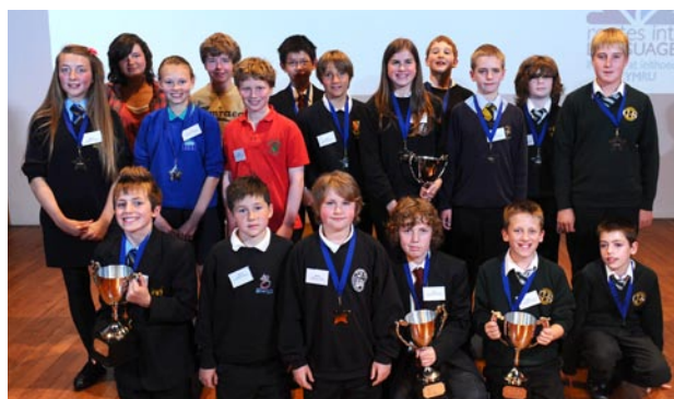
All 18 finalists enjoyed the National Final at National Museum Cardiff

All photographs from the competition can be seen on the Routes into Languages Flickr page.