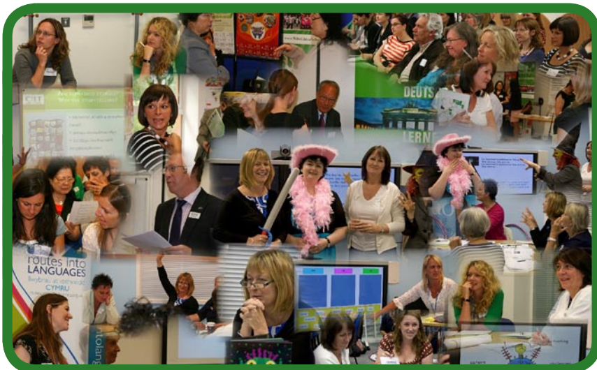
Images from CILT Cymru's annual conference, Languages Wales 2011